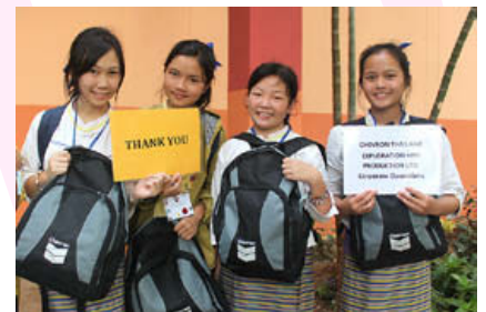
Thank you to Goody Bag sponsors.