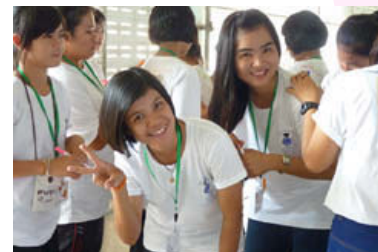
Signing T-shirts is always a highlight of Camp.