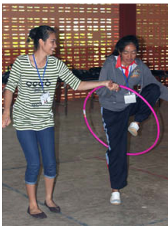
Fun and Games...

Our camps start on Friday evening with registration, a welcome ceremony and icebreaker activities. On Saturday, we have five activity sessions of 50 minutes each and an T-shirt signing activity followed by a beautiful cultural show organized by the students of all the participating schools. On Sunday, we have three activity sessions and end the weekend with a certificate presentation ceremony. We have a good mix