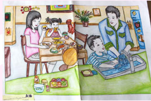
Art Winners (above) A16 and (below) A17.