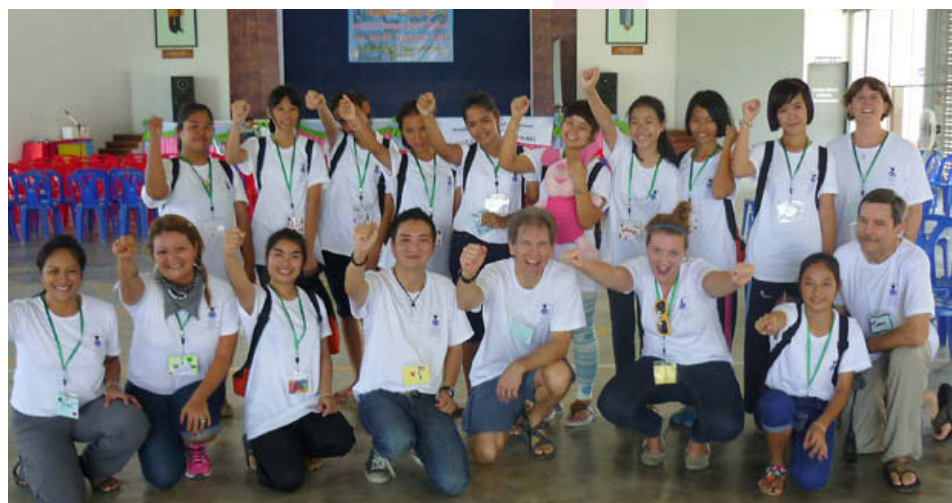
Happy group of students, sponsor volunteers and Peace Corps Volunteers.