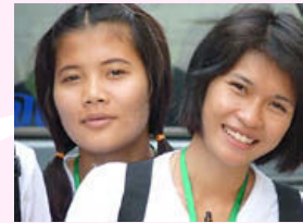
Smiling faces everywhere.

Women's Circle: It was a great camp and no I have not recovered from the camp it's a feeling I want to continue. I feel so fortunate to be involved with such great people doing great things. All your hard work made everything perfect. I want to do it again.