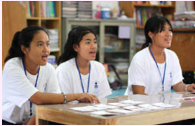
Practicing Th sounds in "Just Say It."

2013 was an unusual year in that we held two English Camps. Our January Camp was held in Suphan Buri at Hansa Sujit Wittaya 2 School. We had 12 participating schools with 108