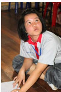
What shall I do now?

team always stems from a GREAT leader. Thank you for sharing your 'sparkling self' and being a great role model. I appreciate you and all you do for others.