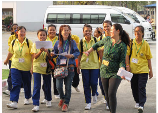
Group of students on their way to the next fun activity.

of academic and non-academic activities like Spelling Bee, Quiz Game, Just Say it, Conversation Cube, Build the Man (Hangman), Computer Literacy, the Shopping game and Fun & Games. The activity stations are run by the volunteers, and all teachers and students participate in every activity.