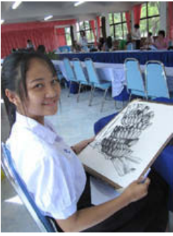
Student shows her drawing skills during a visit to Maneesawet School.

This year we had the privilege of visiting four schools: Hansa Sujit, Maneesawet, Thakum Ngern and Samoengpittayakhom. We provide scholarships to about 10 students per school.