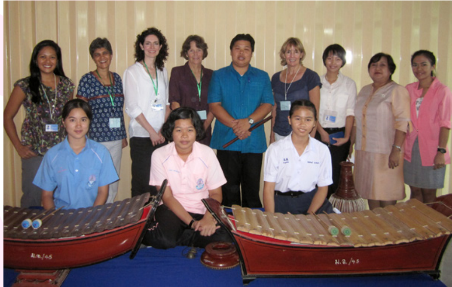
Scholarship Committee members were entertained by the student musicians at Maneesarwet School during a school visit.