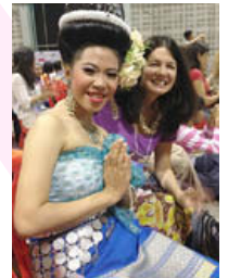
A lovely student in costume gives a wai.

In our January camp the Just Say It activity which concentrates on teaching the pronunciation of "L", "R", "TH", "SH", "CH", etc., sounds was a very popular activity. At our November camp, Fun & Games clearly won the popularity contest.