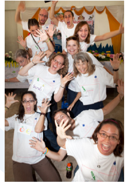
Peace Corps Volunteers at English Camp

We just announced our local effort to collect food donations for these hardy individuals. Peanut butter, American cereals, salsa, chips, tortillas, taco seasoning, American candy, Nuttella, mac & cheese, and that old favorite: booze and wine are the most requested! Let us know if you can help.