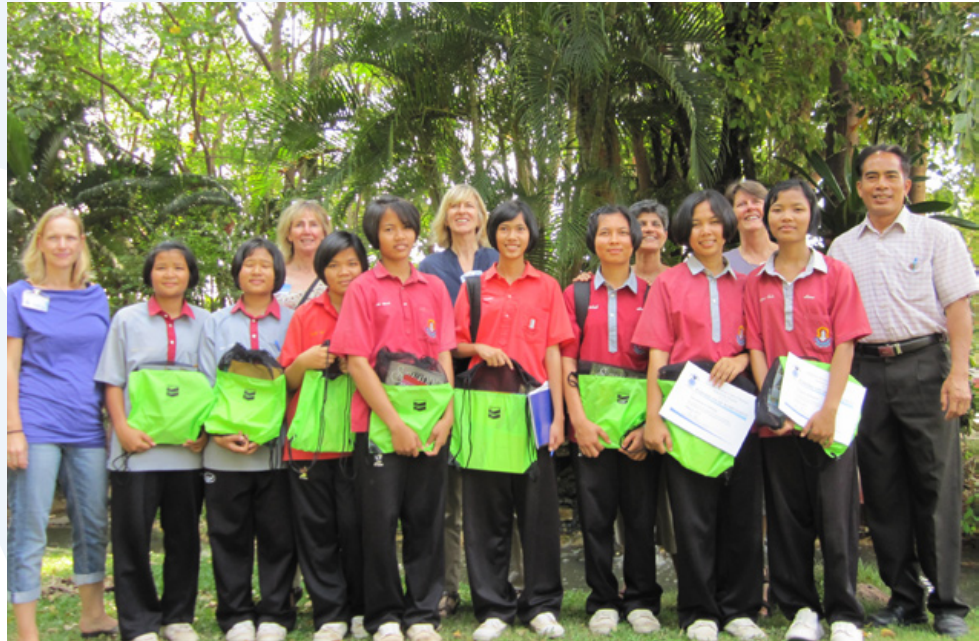
AWC members visit Taelsiri Wittaya School students and their AWC advisor in Surin Province.

This year EDF won "NGO of the Year" at "Thailand NGO Awards 2012" organized by The Rockefeller Foundation, the Resource Alliance and Kenan Institute Asia for its best practices in Resource Mobilization, Accountability, Transparency and Sustainability. Learn more about them by visiting their website: www.edfthai.org/en/